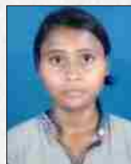
Jyoti MMV 91.44%